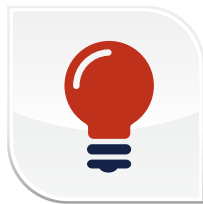
Emergency Lighting Testing