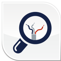
Fixed Wire Test & Inspection