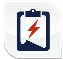
Power Quality Surveys