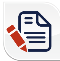
Defect Repairs / Remedial Action